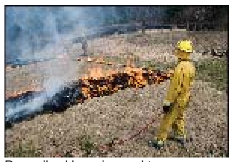
Prescribed burn is used to encourage growth of native vegetation.