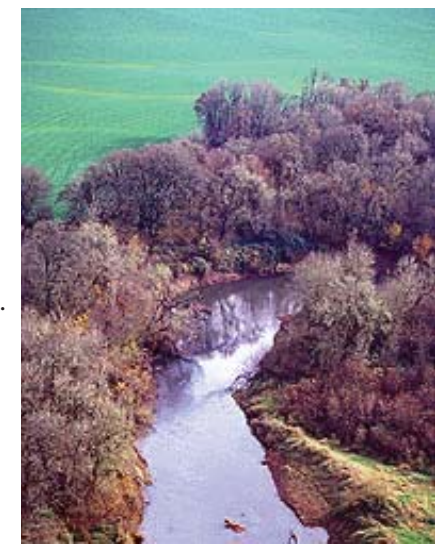
Buffers of trees, shrubs, and grasses protect this stream.

ter for many wildlife species, such as songbirds. Continuous buffers also provide connecting corridors that enable wildlife to move safely from one habitat area to another.