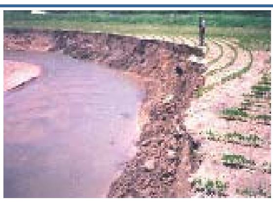
A vegetation buffer strip along with bank protection could have reduced erosion and the loss of valuable cropland.

Vegetation buffers are strips of land with permanent vegetation designed to intercept stormwater runoff and minimize soil erosion. Buffers can reduce the amount of sediment and pollutants carried by runoff to nearby lakes, wetlands, or streams. Soil particles accumulating as sediment in a lake can suffocate organisms and reduce sunlight needed by aquatic life. Sediment often carries pollutants such as phosphorus, a nutrient used in fertilizer. These