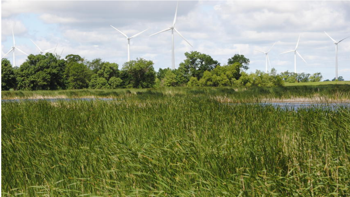
Windmills seen on the Palmer Creek's Wind Farm, 2017.