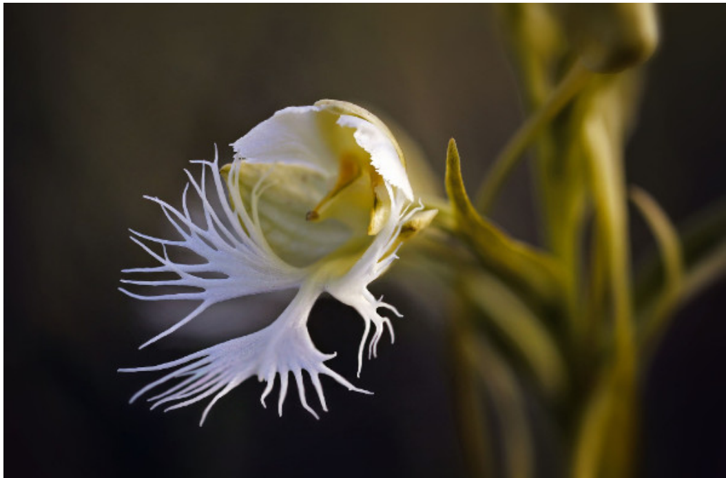
Western Prairie Fringed Orchid